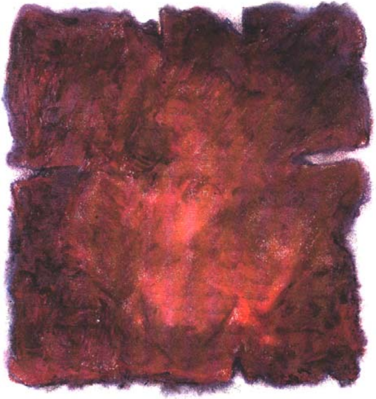
Figure 10: The Heart Speaks , by Diana Boehnert (For a discussion of this picture, see page 13.)