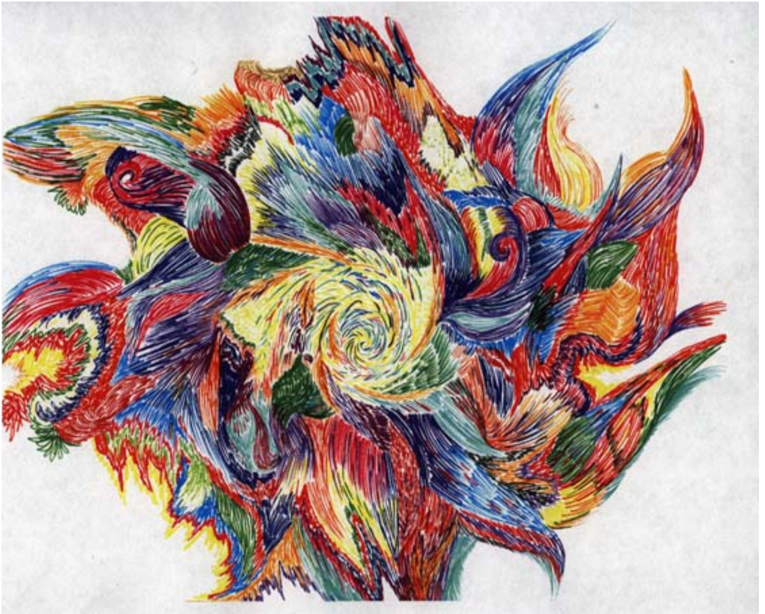
Figure 25: Healing Energy , by Jan

“This drawing began with a circle, and then I just continued to let it flow and expand. It started off as a drawing of grain. I see grain as very nurturing. I love the way grain blows in the wind. It forms a vortex in the center. This is an image that represents my energetic expression of physical and emotional healing. I would like to put this on my bedroom ceiling so that I could look at it every night and remember how good it feels to feel good.”